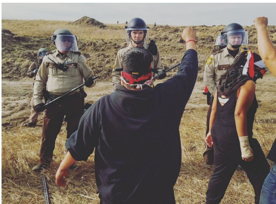
Anishinaabe land defender faces off against North Dakota police forces, Standing Rock 2016

In response to the mobilization against Dakota Access, local and state officials used military tactics to suppress public protest and intimidate water protectors. In May 2017, The Intercept reported on the activities of TigerSwan, a “mercenary” private contractor hired by Energy Transfer Partners to quell the efforts of water defenders at Oceti Sakowin, Standing Rock, North Dakota. 15 The Intercept's initial report — the first in a series of 16 — was based on internal company documents and described illegal actions taken against peaceful Indigenous defenders and misinformation given to local police forces to attack thousands of people encamped near the