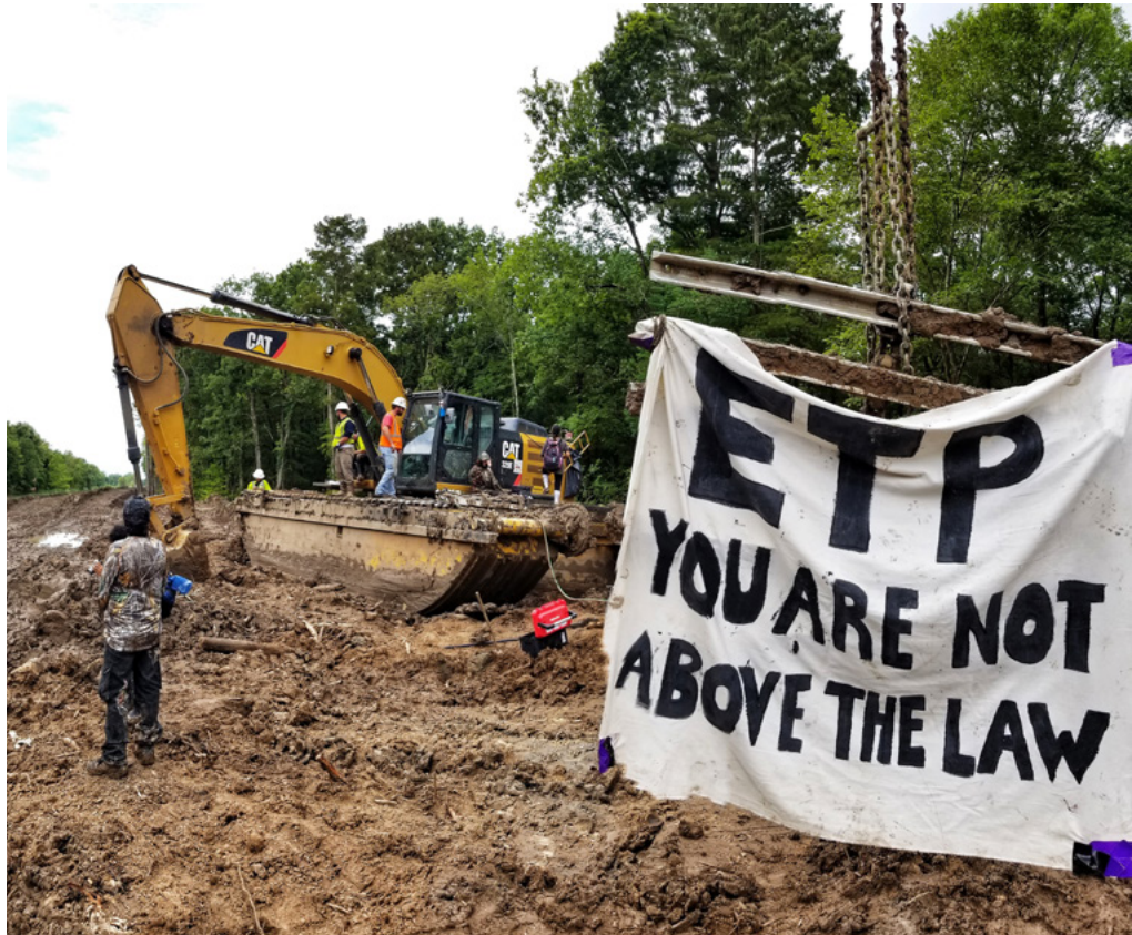
Water Protectors Stop Construction of Energy Transfers Partners' Bayou Bridge Pipeline, L'eau La Vie Camp 2017, photo courtesy of Indigenous Environmental Network.

Our aim is two-fold: First, that Indigenous land defenders are emboldened to see the collective results of their efforts and utilize this information as a resource to garner further support. Second, that settler nation-state representatives, organizations, institutions, and individuals recognize the impact of Indigenous leadership in confronting climate chaos and its primary drivers. We hope that such settlers, allies or not, come to stand with Indigenous Peoples and honor the inherent rights of the first peoples of