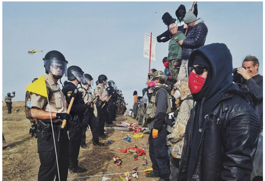
A line of prayer ties separate North Dakota police and water protectors, Standing Rock 2016, photo courtesy of Dallas Goldtooth.

The report situated these abuses in a global context in which governments and industry intimidate and persecute Indigenous communities when they act to defend their lands, territories, water, food sovereignty and security, and ways of life. 15 Tauli-Corpuz cited specific instances of heavy-handed intimidation through militarization, including illegal surveillance, disappearances, forced evictions, judicial harassment, arbitrary arrests and detention, limits on freedom of expression and assembly, stigmatization, travel bans, and sexual harassment. Authorities in Latin America and elsewhere have also utilized false allegations, unfounded prosecutions, and terrorism charges to intimidate Indigenous communities and leadership. These attacks have now spread to social media, where hate speech and racial discrimination add to the violence often