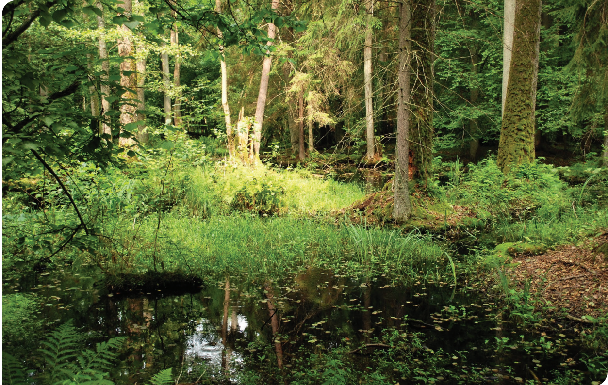
Białowieża Forest in Poland