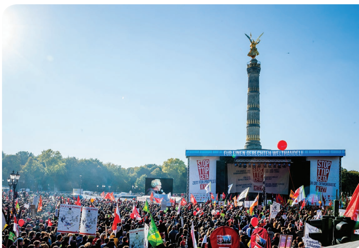
CETA protests in Berlin, 2015

In 2014, the EU responded to that pressure and dropped its plan to label tar sands oil dirtier than other oils, which would have made it harder to import. EU officials, speaking on condition of anonymity, told the Canadian Broadcasting Corporation that a desire not to imperil CETA was a factor in this decision. This cleared the way for Canada to export oil directly into Europe.