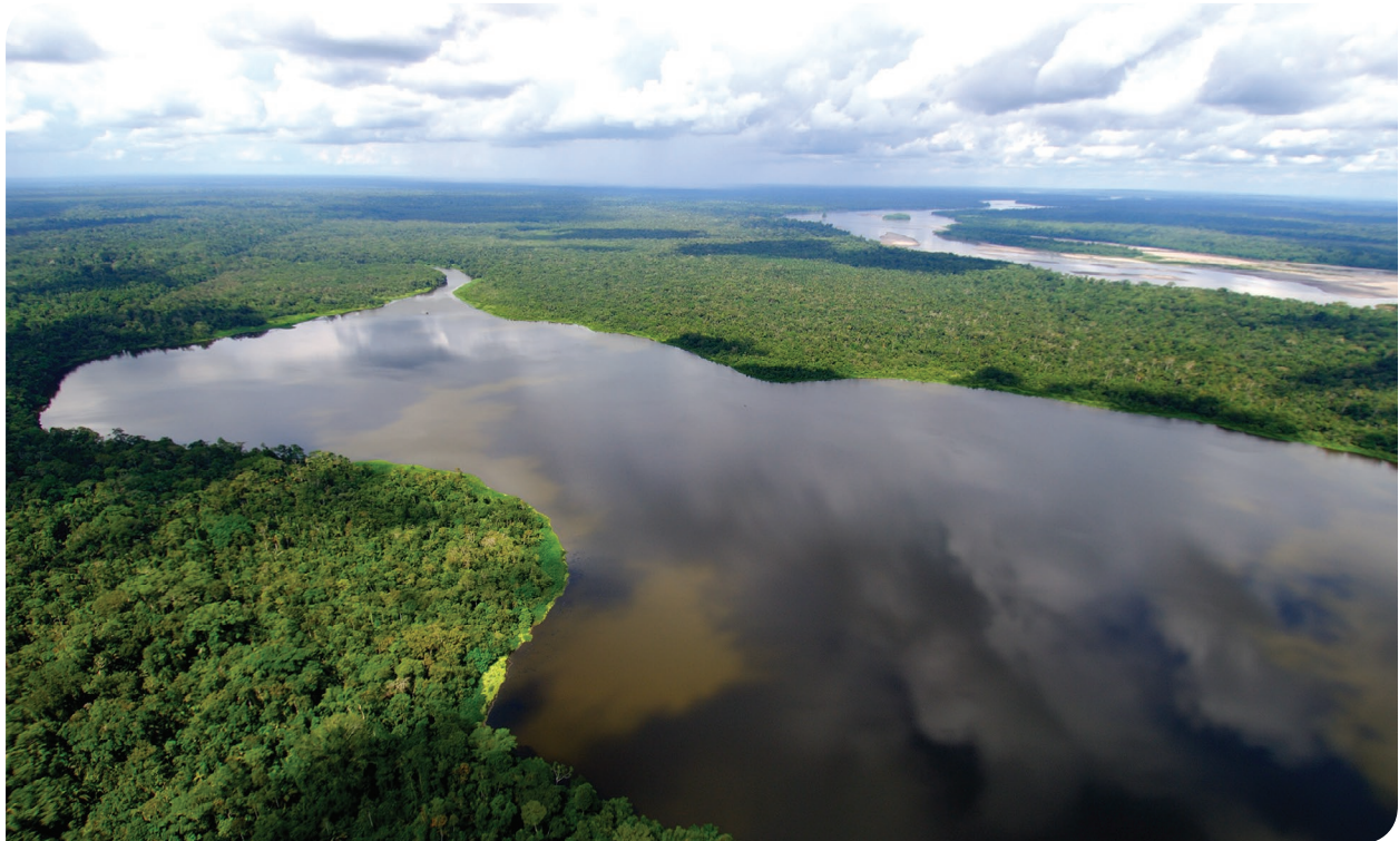
Orellana Province, Ecuador

“The message our Living Forest proposal delivers is aimed at the entire world with the goal of reaching the hearts and minds of human beings everywhere, encouraging us all to reflect on the close relation between Human Rights and the Rights of Nature.” From Kawsak Sacha, The Living Forest: An Indigenous Proposal for Confronting Climate Change, presented by the Amazonian Kichwa People of Sarayaku, Ecuador