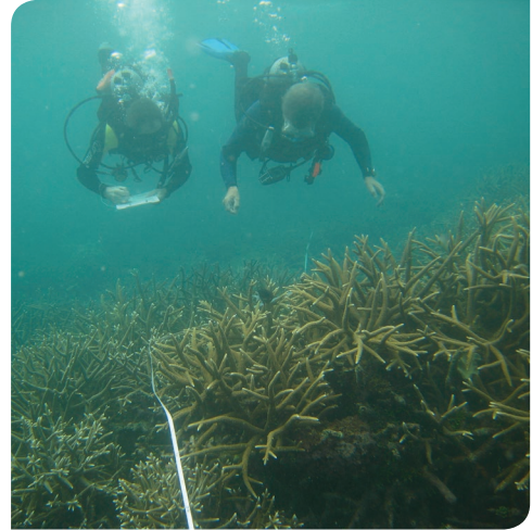
Scientists study the deterioration of the Great Barrier Reef

However that perspective overlooks the fact that judgements such as this provide an example of what kind of judgement is possible and thereby expose the inadequacies of existing legal systems in the face of challenges like climate change. The Tribunal demonstrates that if international and national judicial bodies decided cases involving the critical challenges of the 21 st Century in the same way as the Tribunal does, then law could make a far more significant contribution to addressing climate change that it does now.