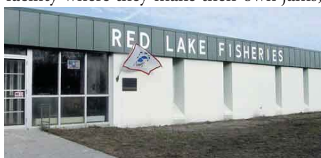
VISIT RED LAKE FISHERIES

Bring your cameras for another picturesque day. After our continental breakfast, we will begin by going to the only closed reservation in the United States. Tribal Fishing Licenses will be obtained for all in the group for a morning of fishing. We will be seeking the world-famous “Red Lake Walleye”. Local tribal members will be our guides to fishing the outlet of Lower Red Lake. After we hopefully catch some walleye, we will take a short trip to the Red Lake Fisheries for a tour of their operation. As we take our tour, we will see our catch processed and frozen. Our next stop will be the Red Lake Foods Building. We will be given a tour of the facility where they make their own jams,