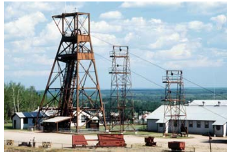
GO DEEP UNDERGROUND IN THE TOWER-SOUDAN MINE!!

Have your cameras ready for today's trip. Today we will sightsee our way up the North Shore of Lake Superior. We will stop at the gorgeous Gooseberry Falls. Take the opportunity to walk up to look at the waterfalls, perhaps wade in the water. Our next stop will be the Split Rock Lighthouse. Beautiful views are abundant at this fully functional lighthouse. Take a break with us and enjoy the beautiful Minnesota wilderness as we have a picnic box lunch! This afternoon, we head inland to look for some indigenous wildlife in the area that include; whitetail deer, timber wolves, black bears, and hopefully a moose or two. We will arrive in Ely, MN later to tour the International Wolf Center. Tonight we rest our heads at the Bois Forte Band's Fortune Bay Hotel & Casino. (B, L, D)