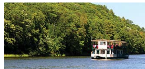
ALL ABOARD THE MISSISSIPPI BELLE!

This morning you may have one last chance to explore Mall of America (based on departure time). Airport transfers are available at 8AM, 10AM and Noon. We hope that by taking this tour, you have a better understanding of the Native Americans, this region, and the need to find solutions to keeping Mother Earth healthy for generations to come. (CB)