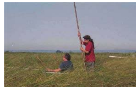
HARVEST WILD RICE

After our continental breakfast, we'll have our first chance to see a low cost way of living "green". We will visit the Schumacher's Straw Bale House. This house was built for around $20,000. The family lives off their farm by growing their own foods, and is completely off the electrical grid. Next stop, experience the Bio-House at